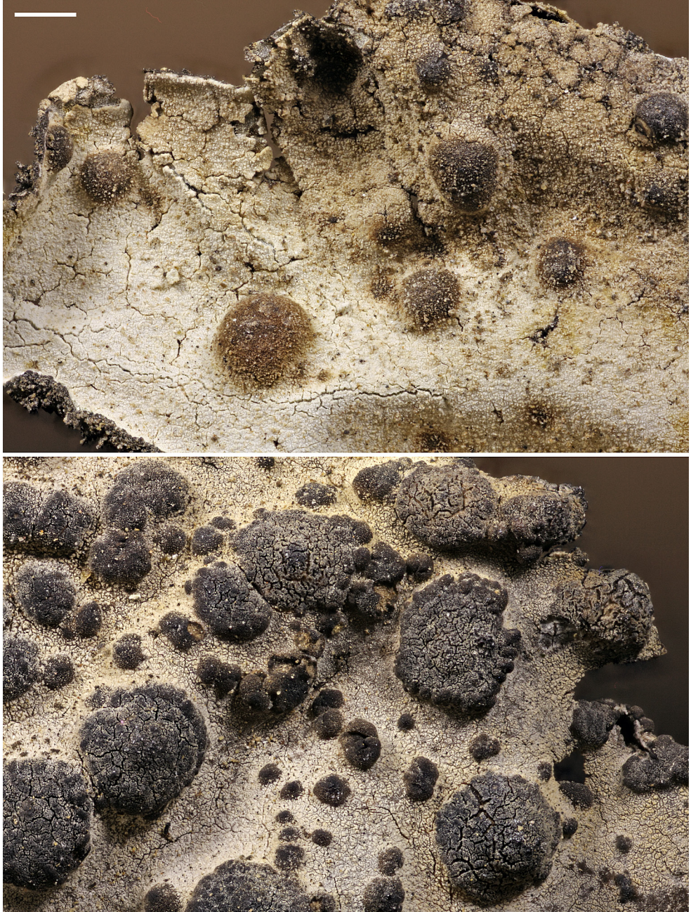
Fig. 2. Tremella umbilicariae on Umbilicaria (holotypus). Scale bar = 1 mm (the same for both photographs).

Characterized by large, dark brown, convex basidiomatal galls, long and narrow, 1-transseptate basidia, 19.7\text{--}25.2 \times 7.2\text{--}7.8 \mu\text{m} , and relatively large basidiospores, 7.6\text{--}9.4 \times 6.1\text{--}7.6 \mu\text{m} .